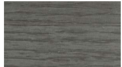
Shediac Grey Gris Shédiac