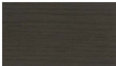
Shades of Oak* Nuances de Chêne