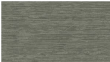
Niagara Mist Brouillard du Niagara