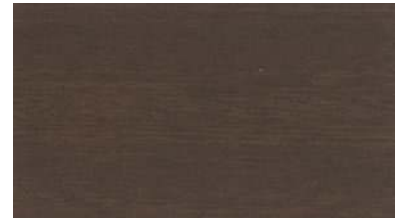
Dark Walnut Noyer Foncé