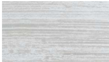
White Sail Voile Blanche