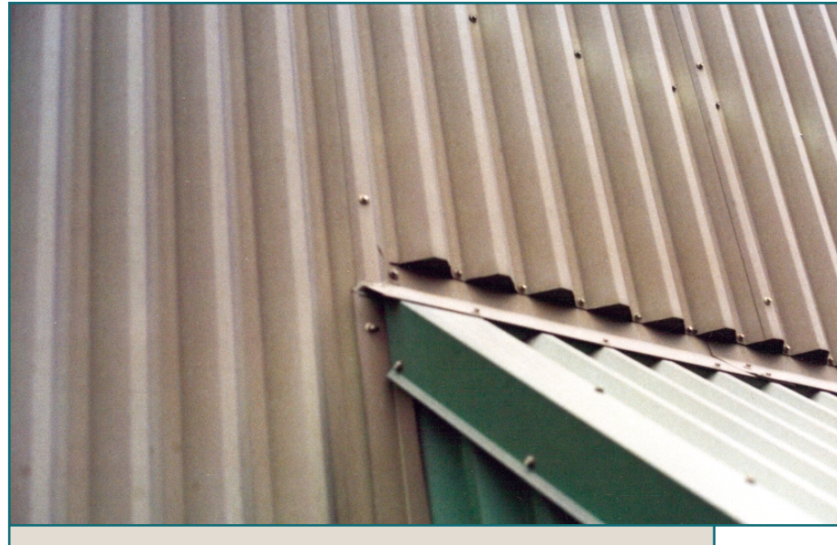
Figure 2: Mine smelter building exterior. Base edge and 45° angled cladding exposure. Nineteen years exposure in Northern Ontario.

Recovery Boiler Building (Ontario): Barrier Series was used here to enclose the recovery boiler building, 11 years old at the time of inspection. The cladding system used a 200/100 exterior and 200/100 liner. During recovery, the spent cooking liquor from the pulping process (black liquor) is first concentrated and then combusted to remove dissolved organic matter and reclaim alkali. The interior atmosphere is hot, the wall and the roof surfaces are constantly contaminated with alkaline sulphate and the air is contaminated with sulphur-bearing gases. The interior liner sheet and deck were in excellent condition. The exterior cladding is subjected to an even more aggressive situation. In addition to the alkaline sulphate, the exhausts from the other operations (including corrosive