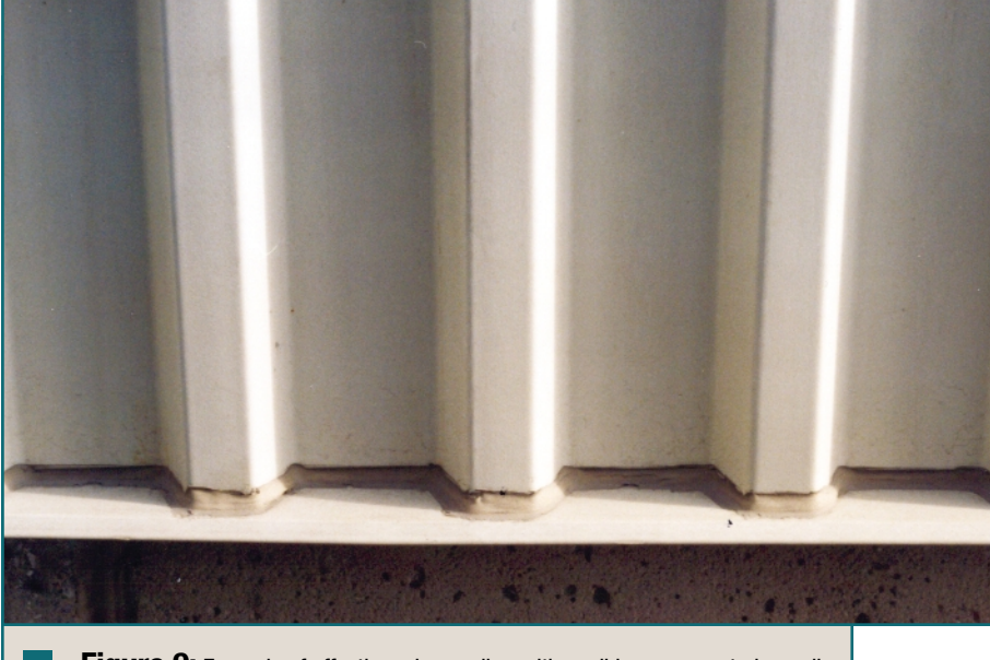
Figure 9: Example of effective edge sealing with caulking on an exterior wall.

The exceptional performance of Barrier Series in the broadest cross section of corrosive applications is the strongest confirmation that it is the foremost corrosion resistant cladding material. While Barrier Series has been used to striking aesthetic advantage in cladding design, the principal attribute is long-term