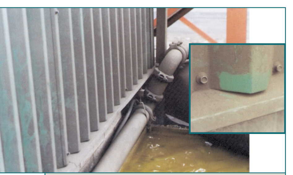
Figure 1: Mine water cooling tower. West exposure above the tanks. Insert: A quick cleaning showed that the drip edge was in excellent condition. Eleven years exposure in Northern Ontario.