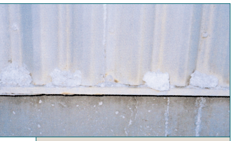
Figure 4: Pulp & paper plant, recovery boiler building. Ground level west exposure below exhaust duct showing contaminate build-up and minor edge creep on the cladding. Eleven years exposure in Northern Ontario.

Series since the initial applications in Ontario. A large Kraft and fine paper mill in Quebec used Bone White and Sky Blue in many insulated, double skin construction areas. The colour retention advantage of Barrier Series can be seen in Figure 6 showing a building with both new and nine year-old cladding.