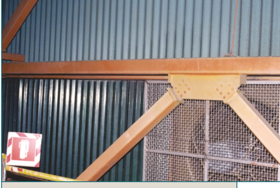
Figure 3: Mine refinery building interior. The Barrier Series cladding is above the exhaust fan. Eleven years of exposure in Northern Ontario.