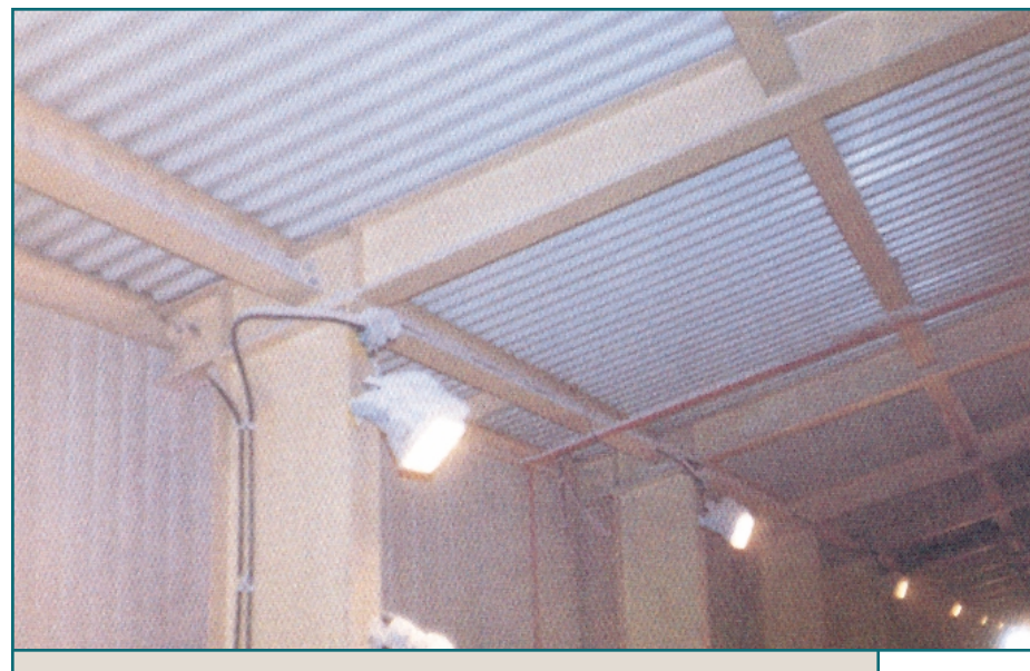
Figure 7: Potash plant, raw ore storage interior. A hot and humid potash environment containing potash dust. Note potash build-up on light fixtures. Eleven years exposure in Saskatchewan.